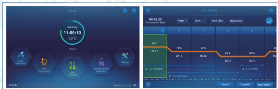
Operation Interface on Device